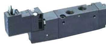
B Series Catalog: 0600P www.parker.com/pneu/b