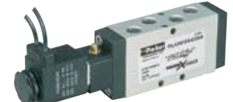
Viking Xtreme Catalogs: 0677 & 0600P www.parker.com/pneu/vikingx