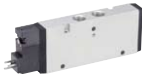
EZ Inline Catalog: 0683 www.parker.com/pneu/EZinline