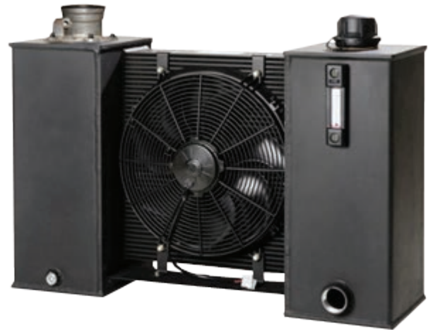
Parker Cross-Flow Oil Cooling System