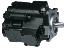
Parker Piston Pump