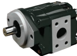
Parker Piston Pump